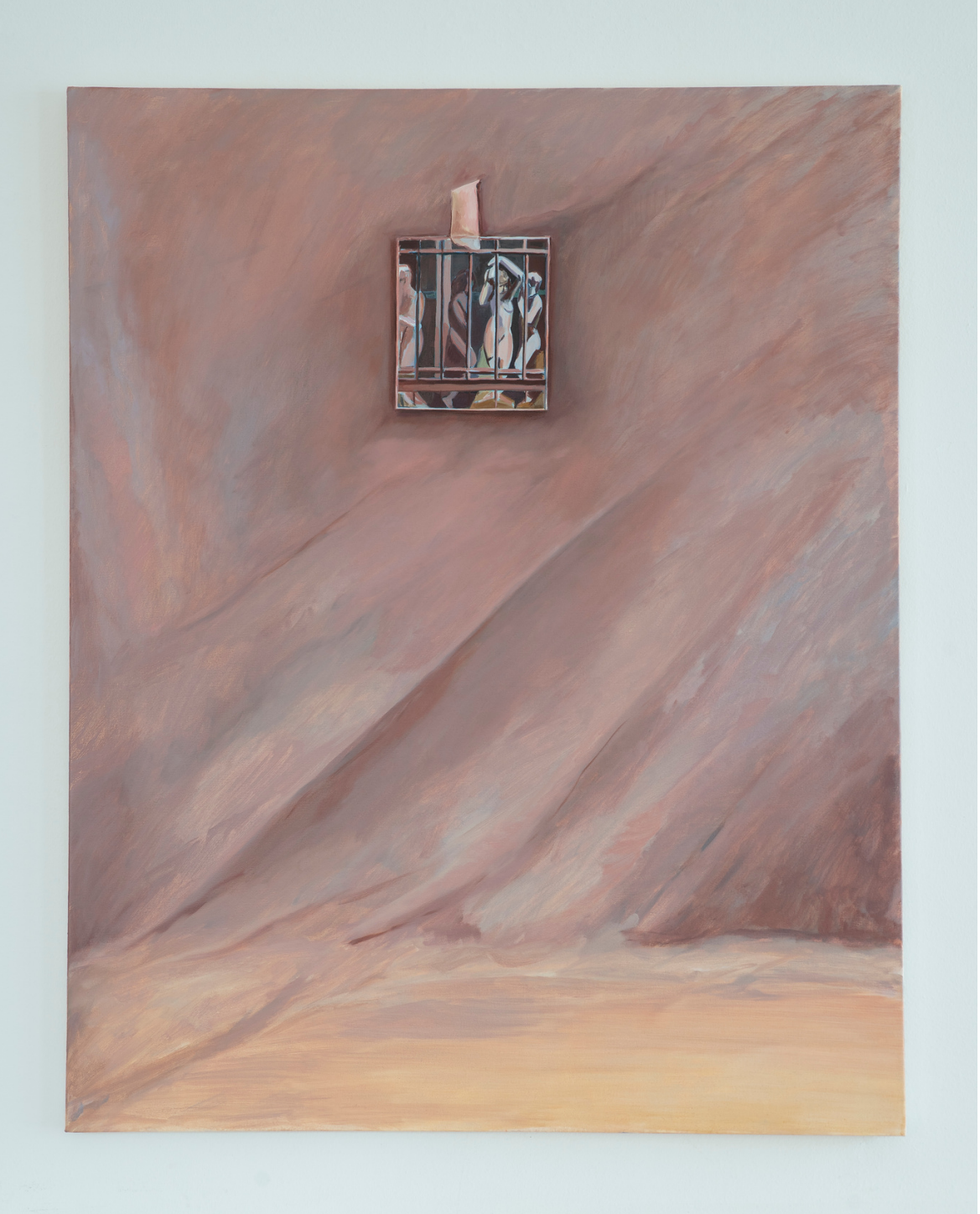
Hídden oil on canvas 100 x 80 cm 2024