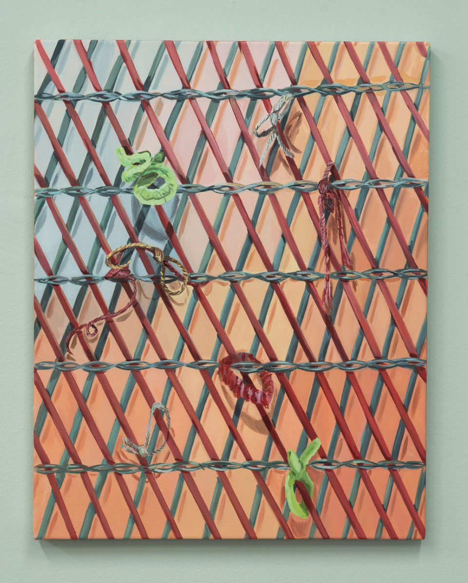
Tied I oil on canvas 60 x 50 cm 2024