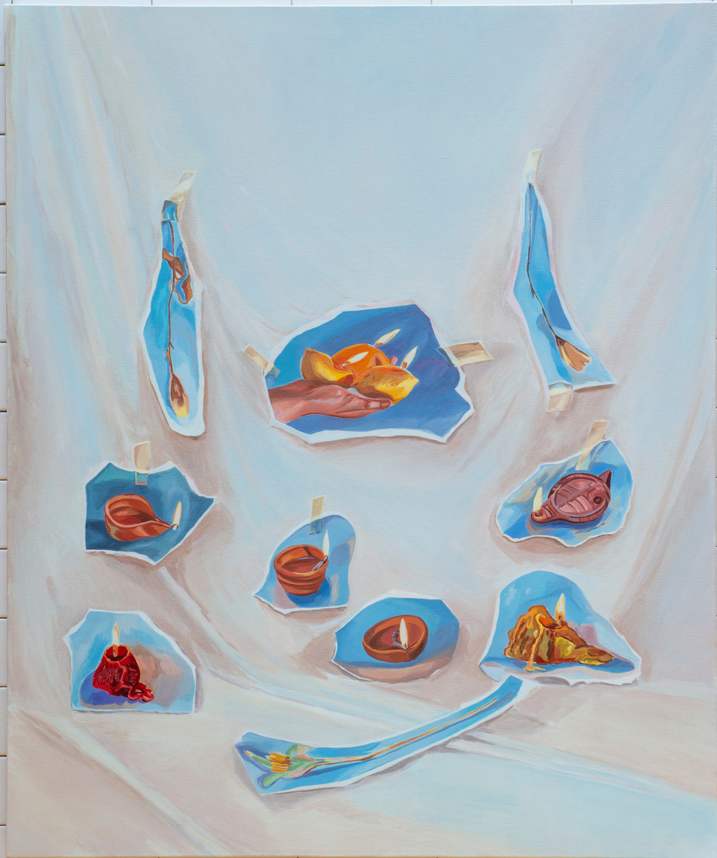
Medicine oil on canvas 120 x 100 cm 2024 £4,500