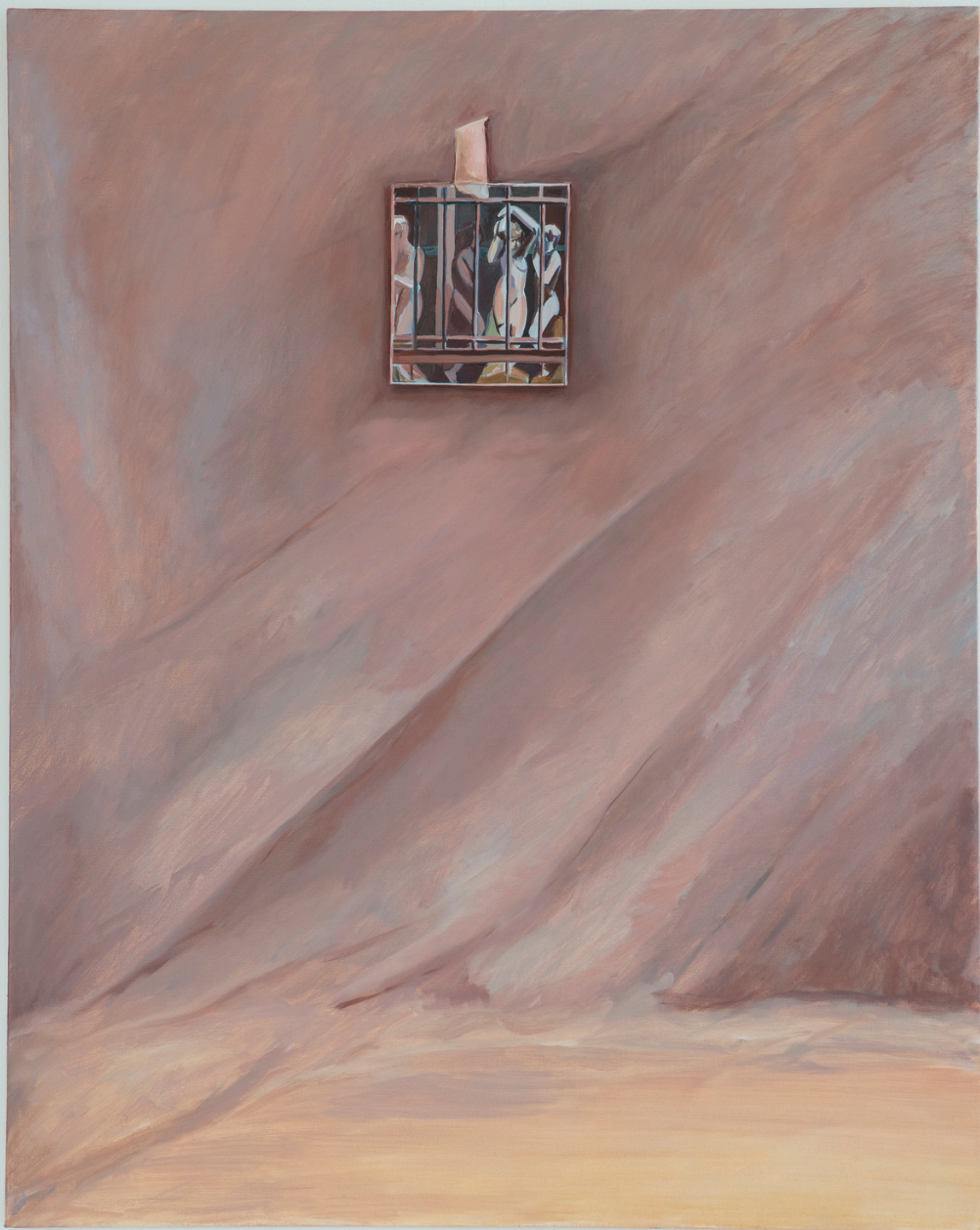
Hidden oil on canvas 100 x 80 cm 2024 £3,850