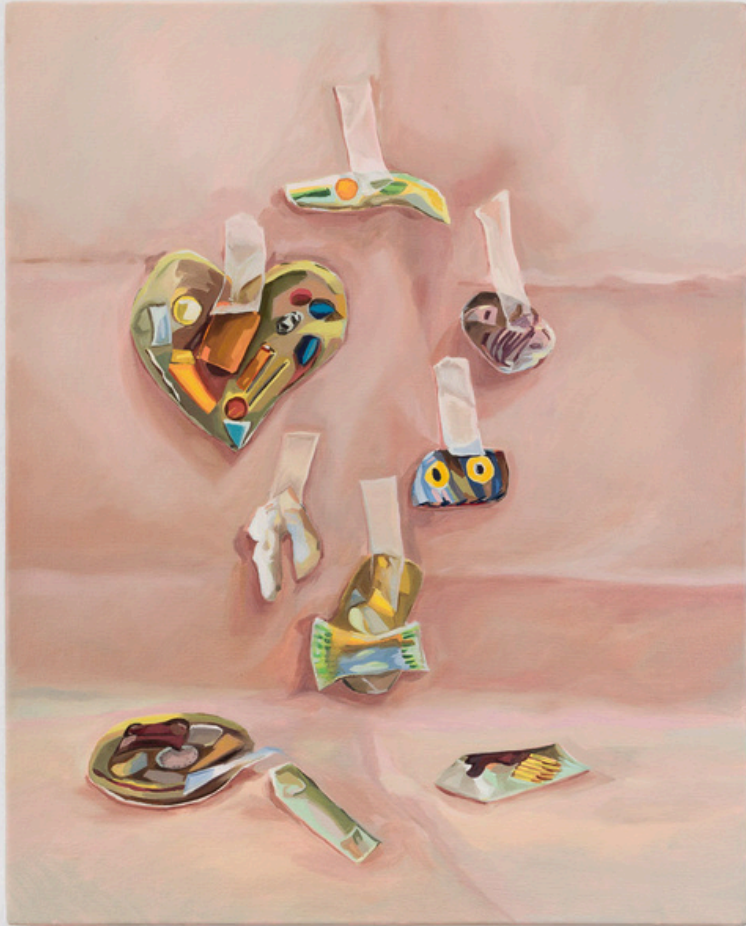
Gathering oil on canvas 30 x 30 cm 2023 £1,850