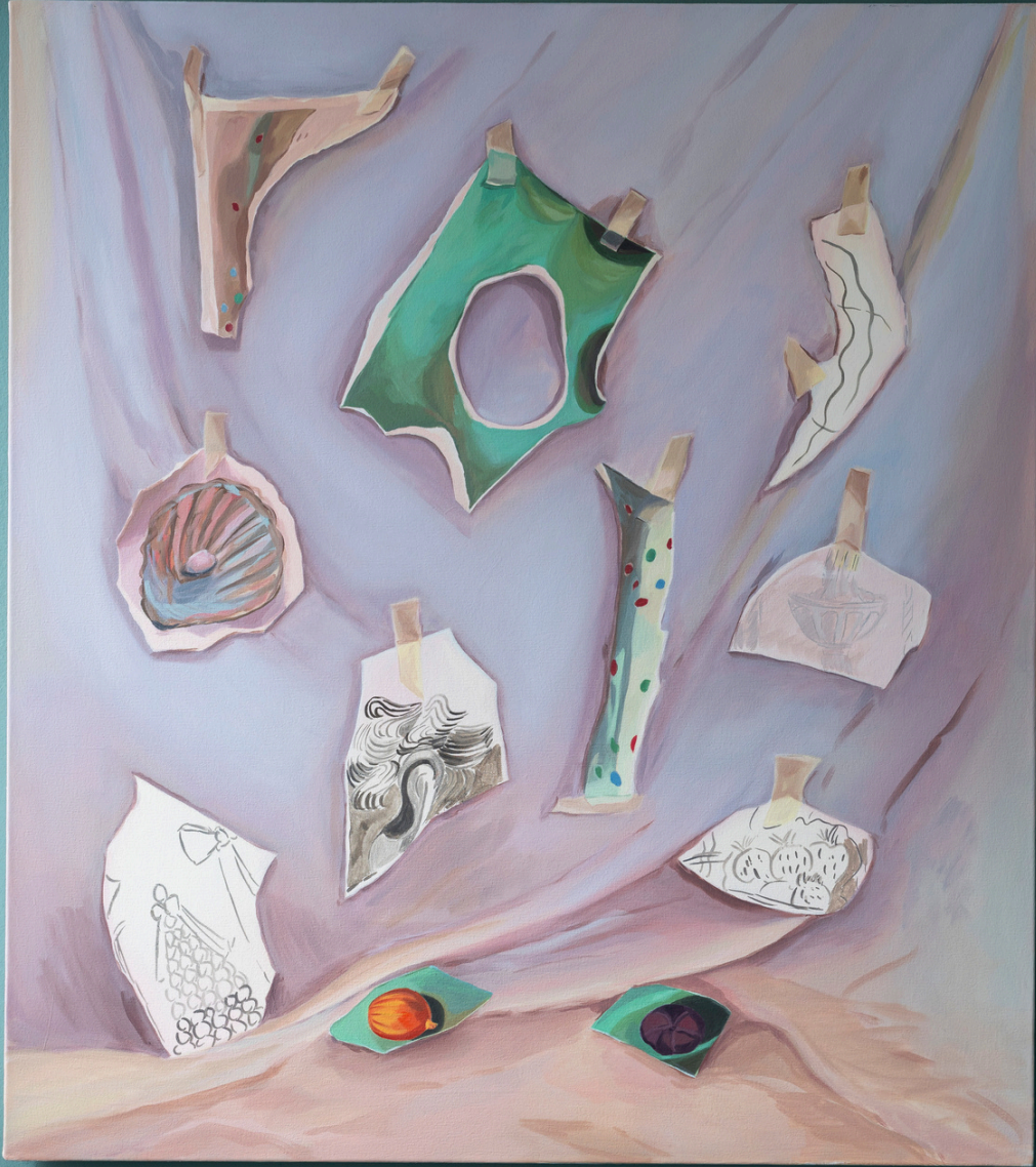
Many Parts oil on canvas 92 x 82 cm 2024 £3,850