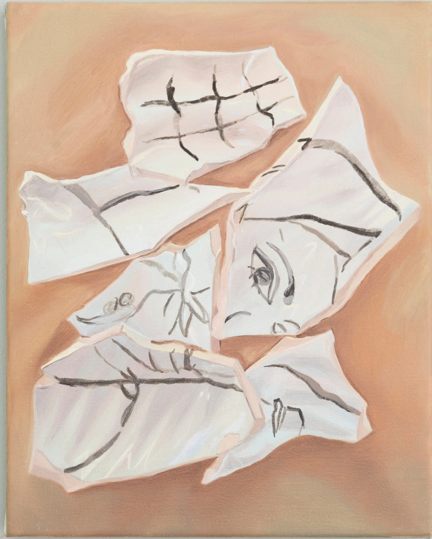
Mirror oil on canvas 30 x 25 cm 2023 £1,250