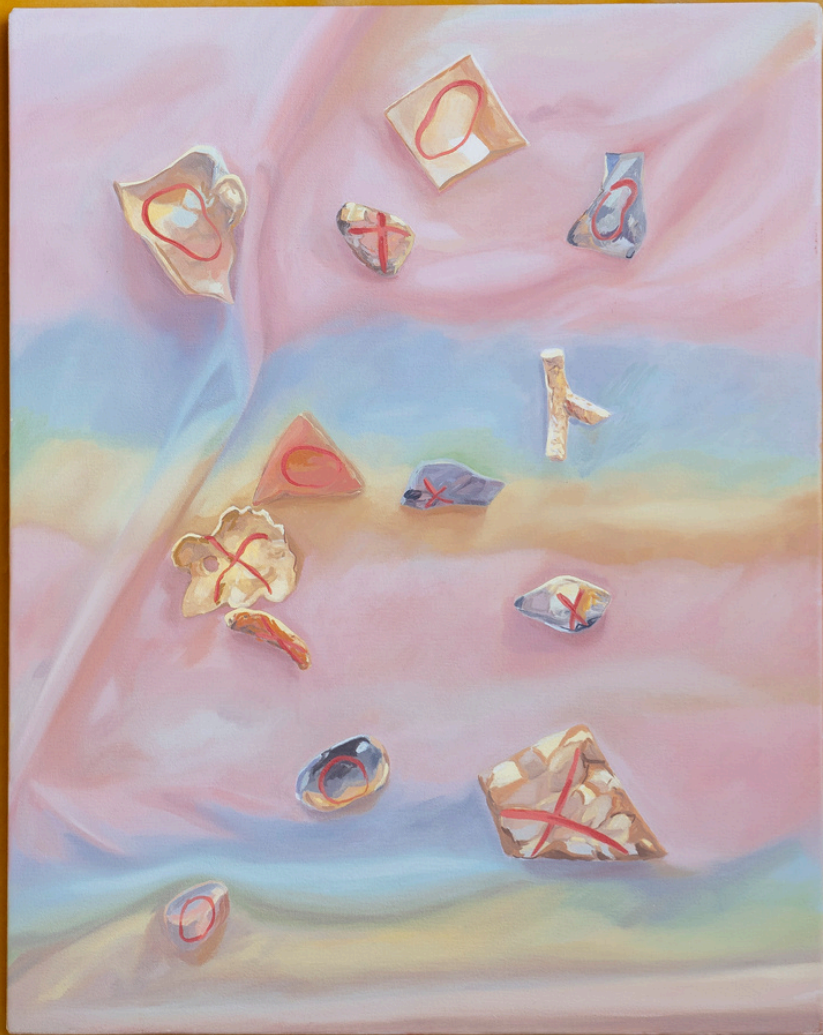
XO oil on canvas 55 x 45 cm 2023 £1,850