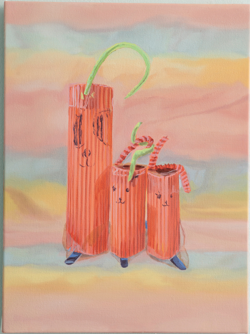
Guardians oil on canvas 30 x 25 cm 2023 £1,250