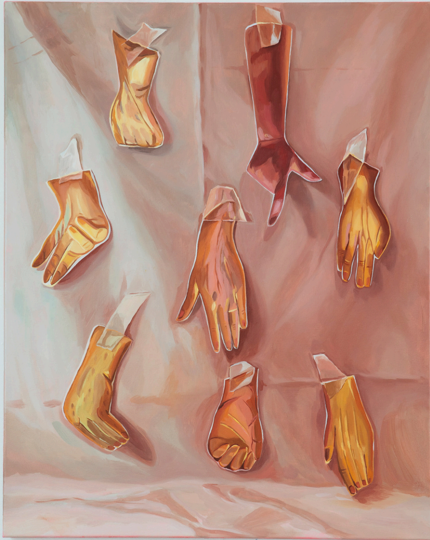
Show of Hands oil on canvas 80 x 65 cm 2023 £3,000