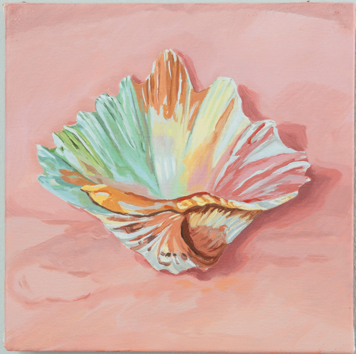
Untitled (Shell) oil on canvas 20 x 20 cm 2022 £500