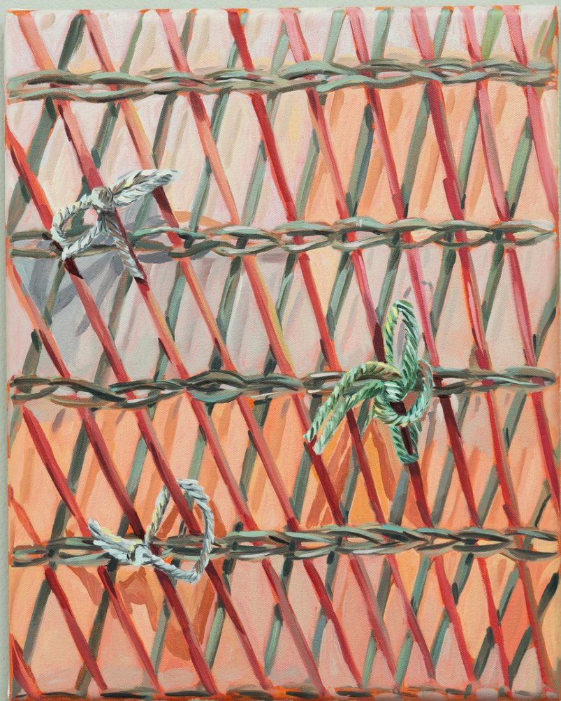
Tied II oil on canvas 32 x 25 cm 2023 £1,250