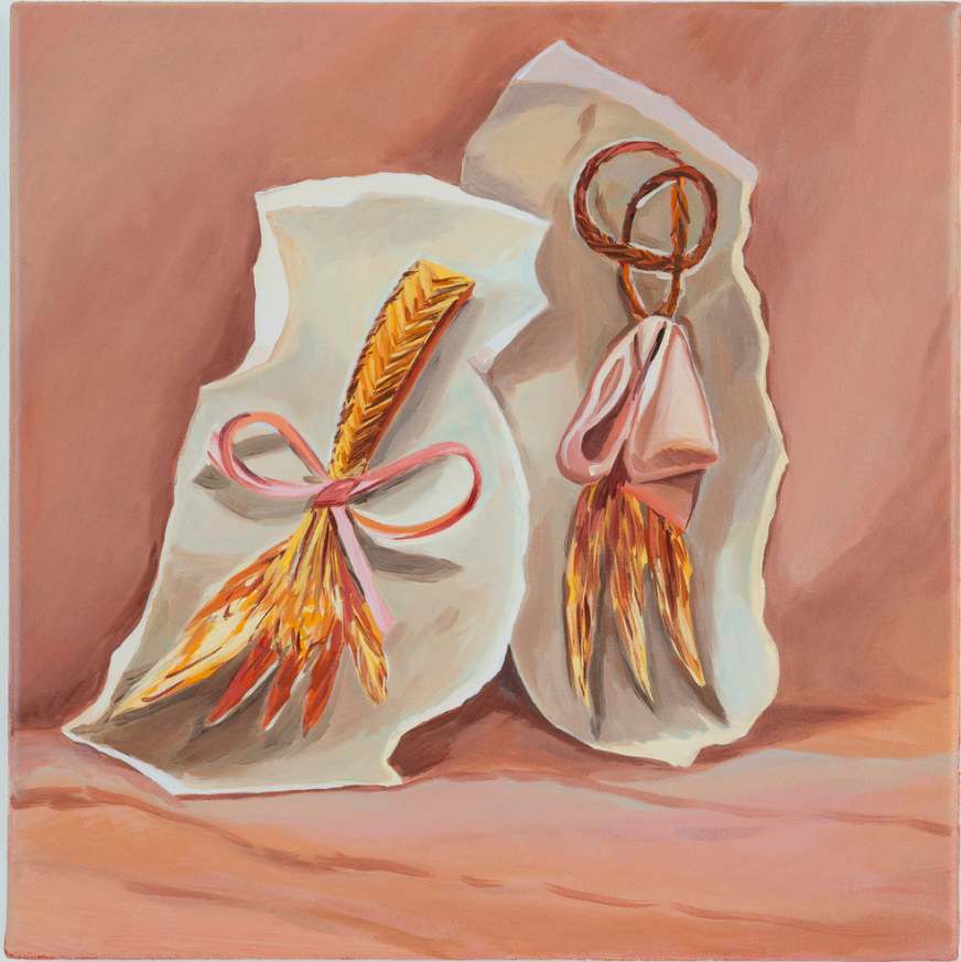
Two Charms oil on canvas 30 x 30 cm 2024 £1,250