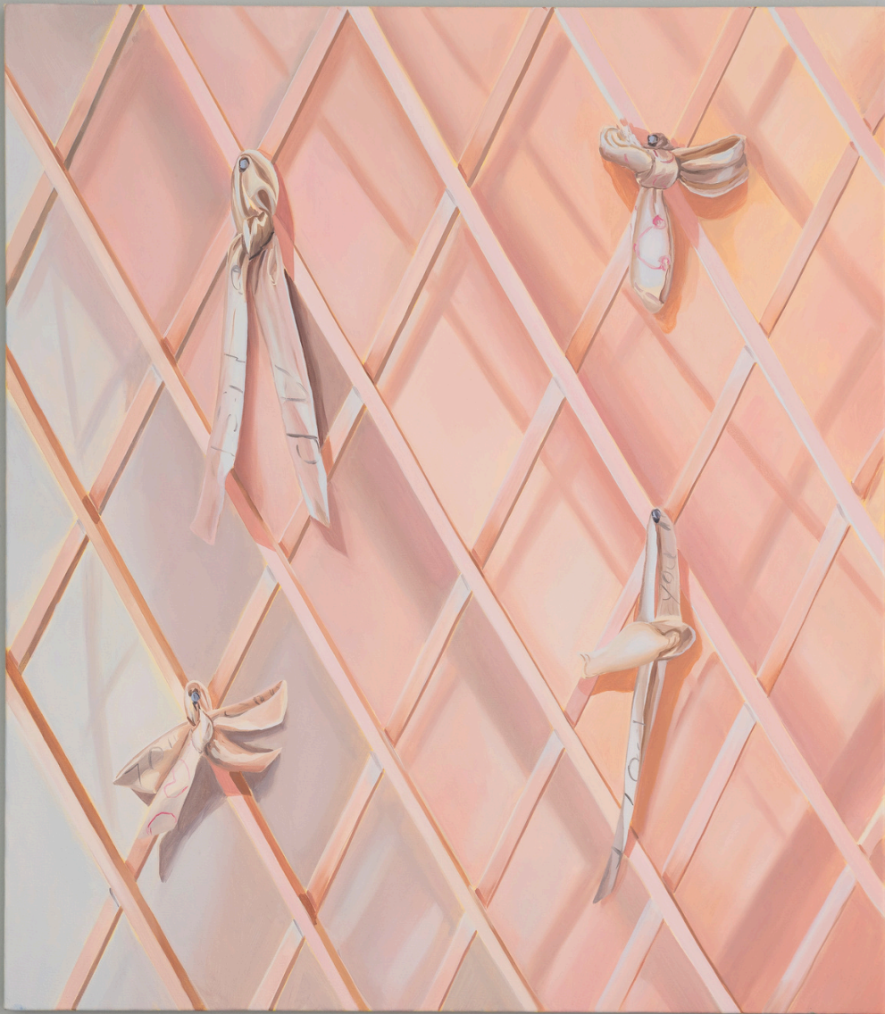
Leftovers oil on canvas 80 x 70 cm 2023 £3,250