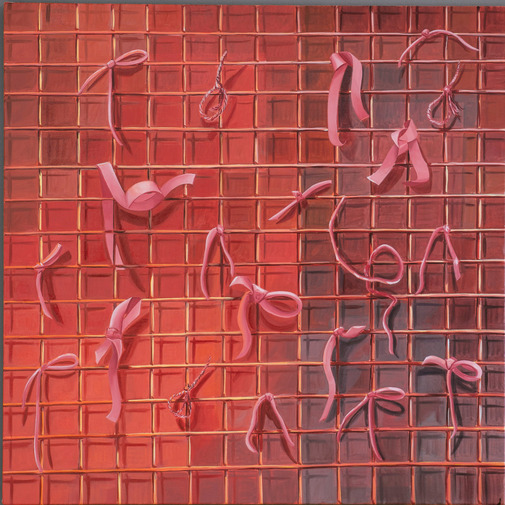
Hand-tied I oil on canvas 77 x 77 cm 2024 £3,500