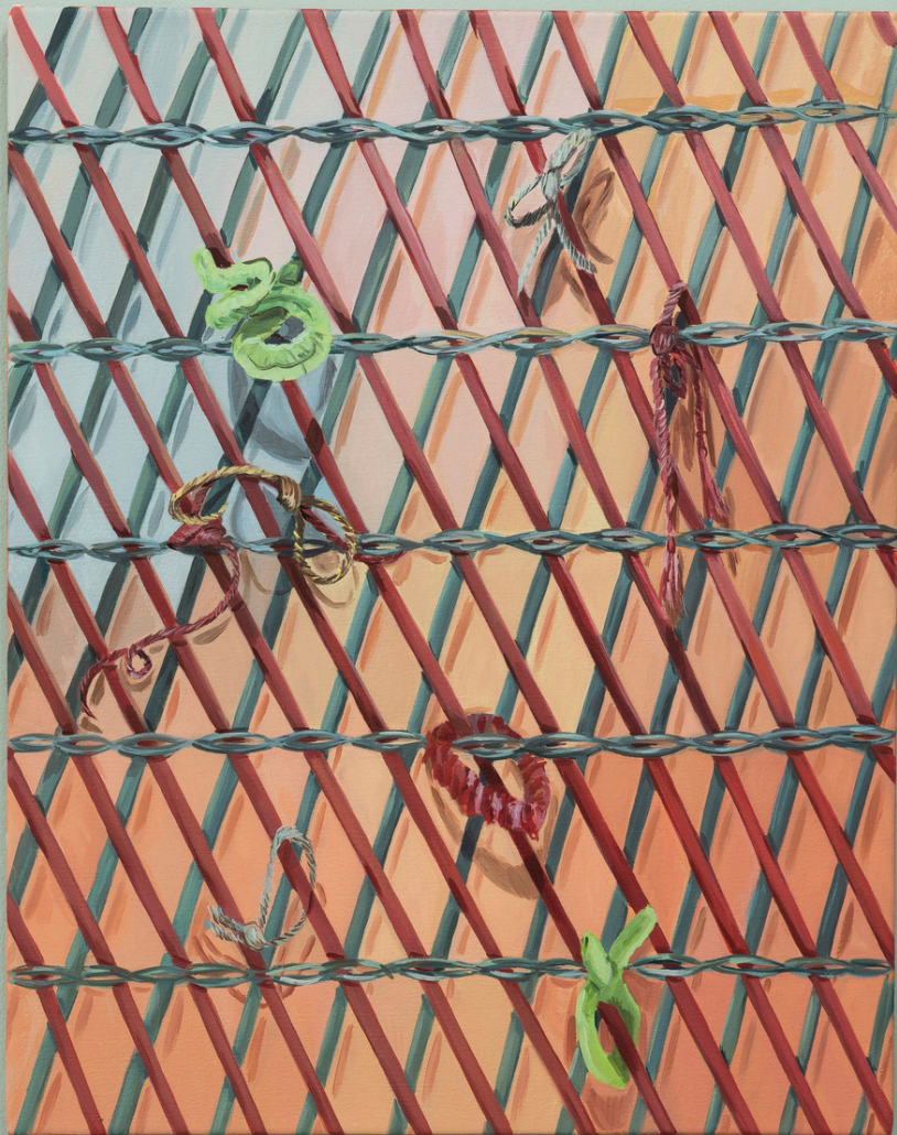
Tied I oil on canvas 60 x 50 cm 2024 £2,250