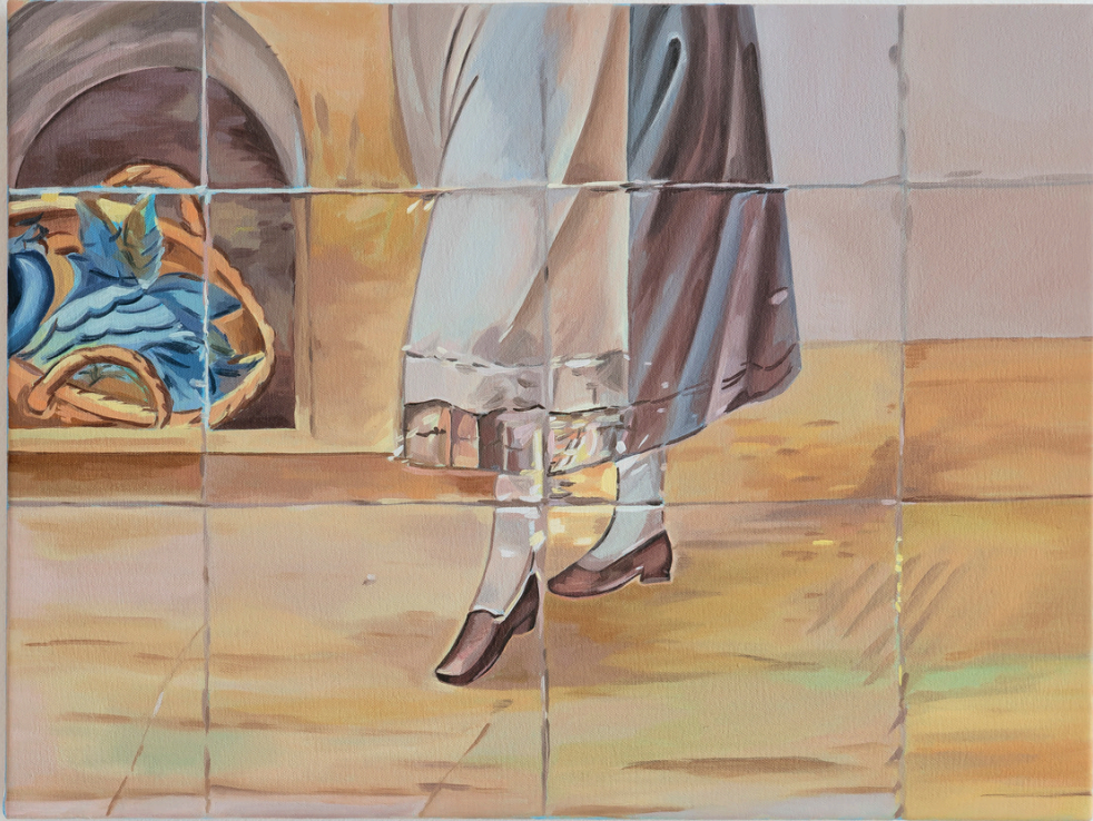
Footsteps oil on canvas 30 x 40 cm 2024 £1,500