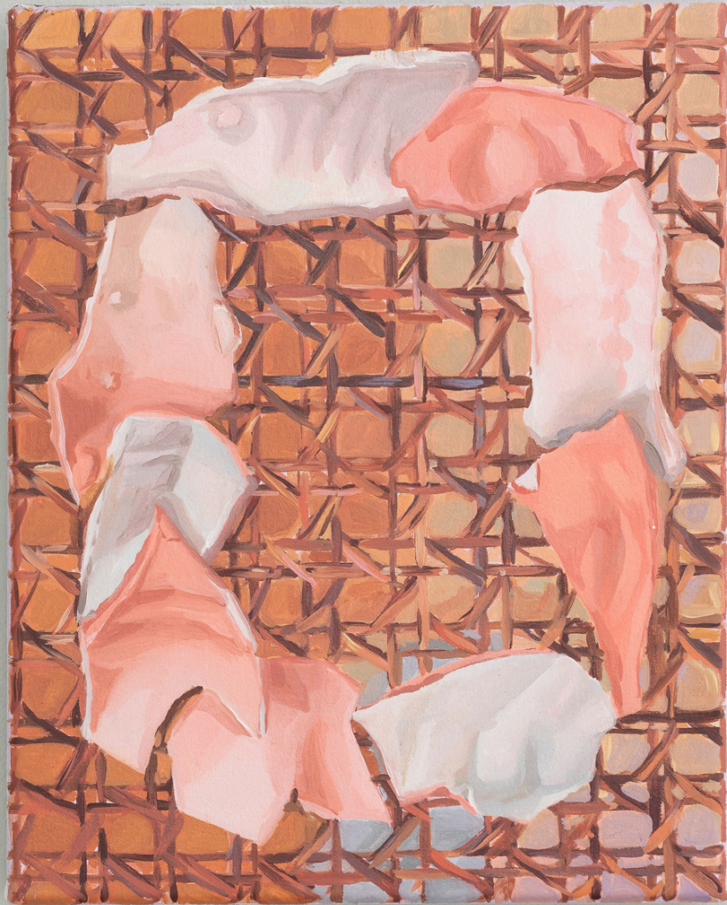
Endless oil on canvas 30 x 25 cm 2021 £1,250