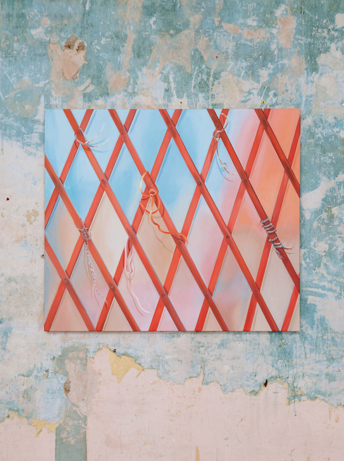
Drifter oil on canvas 77 x 67 cm 2024 £3,000